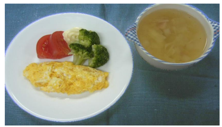
Figure 1: Actual LCD for meal tolerance test (MTT) for breakfast

Methods included two examinations for the subjects. One is the usual 75g oral glucose tolerance test (75gOGTT) with the measurements of blood glucose and insulin (immunoreactive insulin, IRI). Another exam is MTT. The content was the super-LCD meal, which the authors have initiated and developed for years. It has 307 kcal in energy, which has the same as that of 75gOGTT. The detailed content of the meal was that Omelet, broccoli, tomato, mayonnaise, and consommé soup with the nutritional elements of energy 307kcal, protein 13.8 g, fat 23.9 g, and carbohydrate 5.7 g (Figure 1).