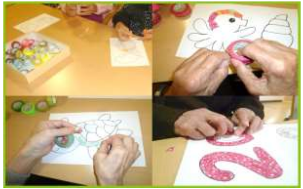
Figure 1: Actual scenes of masking art-work.

The subjects visiting the day care center and participating this project were working on masking tape ( Figure 1 ). At that time, all the subjects were having fun, choosing masking tapes of all colors and patterns according to their own ideas, and sticking them freely.