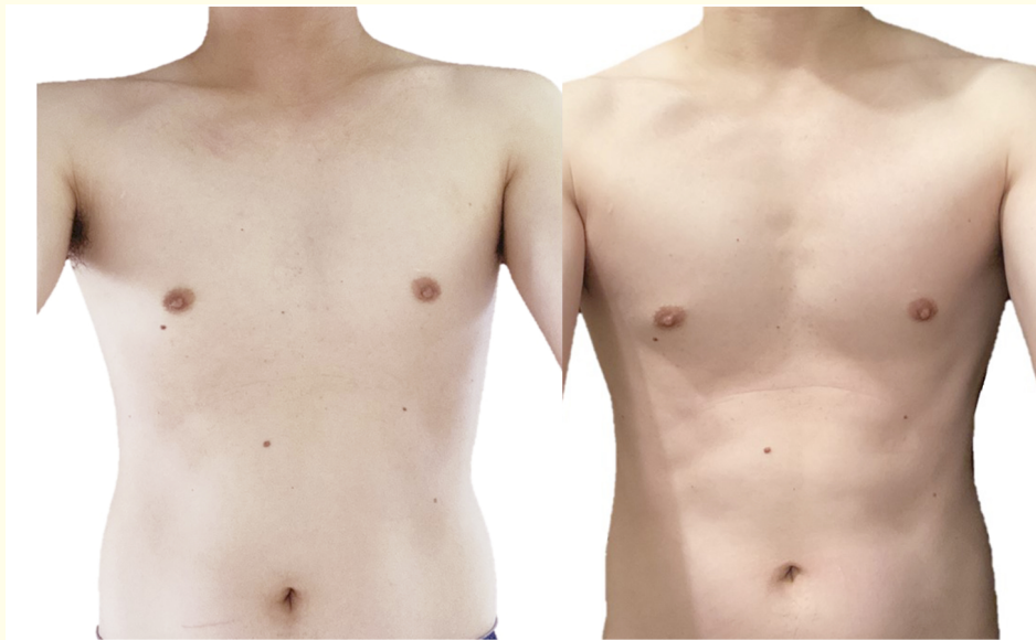
Figure 1: Changes in chest muscles before and after the home self-training on push up.

The following data were obtained in the 0, 4, and 8 weeks of this project. The chest circumference was 94 cm, 94 cm, 96.5 cm, and the number of continuous push-ups was 45, 70, 100, respectively. Comparing the chest images, a macroscopic increase in the muscle mass was observed (Figure 1). This practice could be continued during 2 months, and the positive changes were observed functionally and objectively.