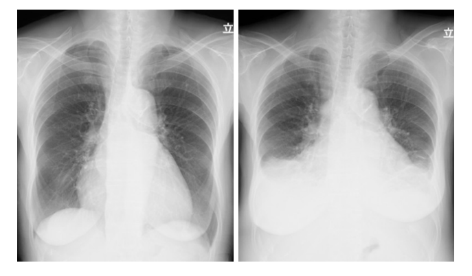
Figure 2 Comparison of the chest X-ray. 2a: unremarkable findings in stable period on May, 2020, 2b: bilateral pleural effusion in admission on Feb, 2021.

Af and low voltage are detected on admission.