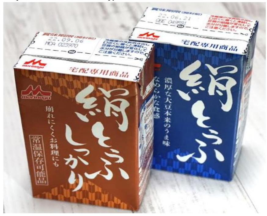
Figure 2: Japanese healthy tofu with less carbohydrate suitable for LCD. a) Blue-color tofu: regular silk tofu, with 250g weight, carbohydrate 2.9g /100g. b) Brown-color tofu: protein-plus tofu, with 253g weight carbohydrate 2.7g/100g.

improve his diabetic condition as much as possible. Among them, he has reduced the amount of rice, bread and noodles as possible, which are made of carbohydrate. Instead of these foodstuffs, he has tried to take "Japanese healthy silky Tofu" which includes less carbohydrate and more protein (Figure 2).