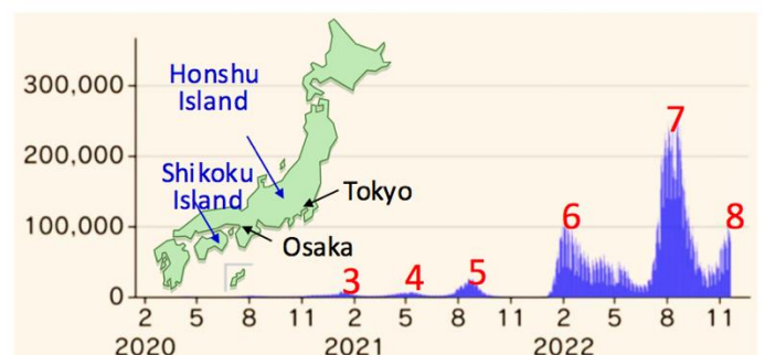
Figure 1: Daily total new patients with COVID-19 in all Japan for recent 3 years, there are 3rd – 8th big waves of COVID-19 infection until now.

2022, there were summer music and dance festivals in Shikoku, as well as the nationwide general athletic meet for high school students [10]. These factors may be involved in the acute increase in Aug 2022.